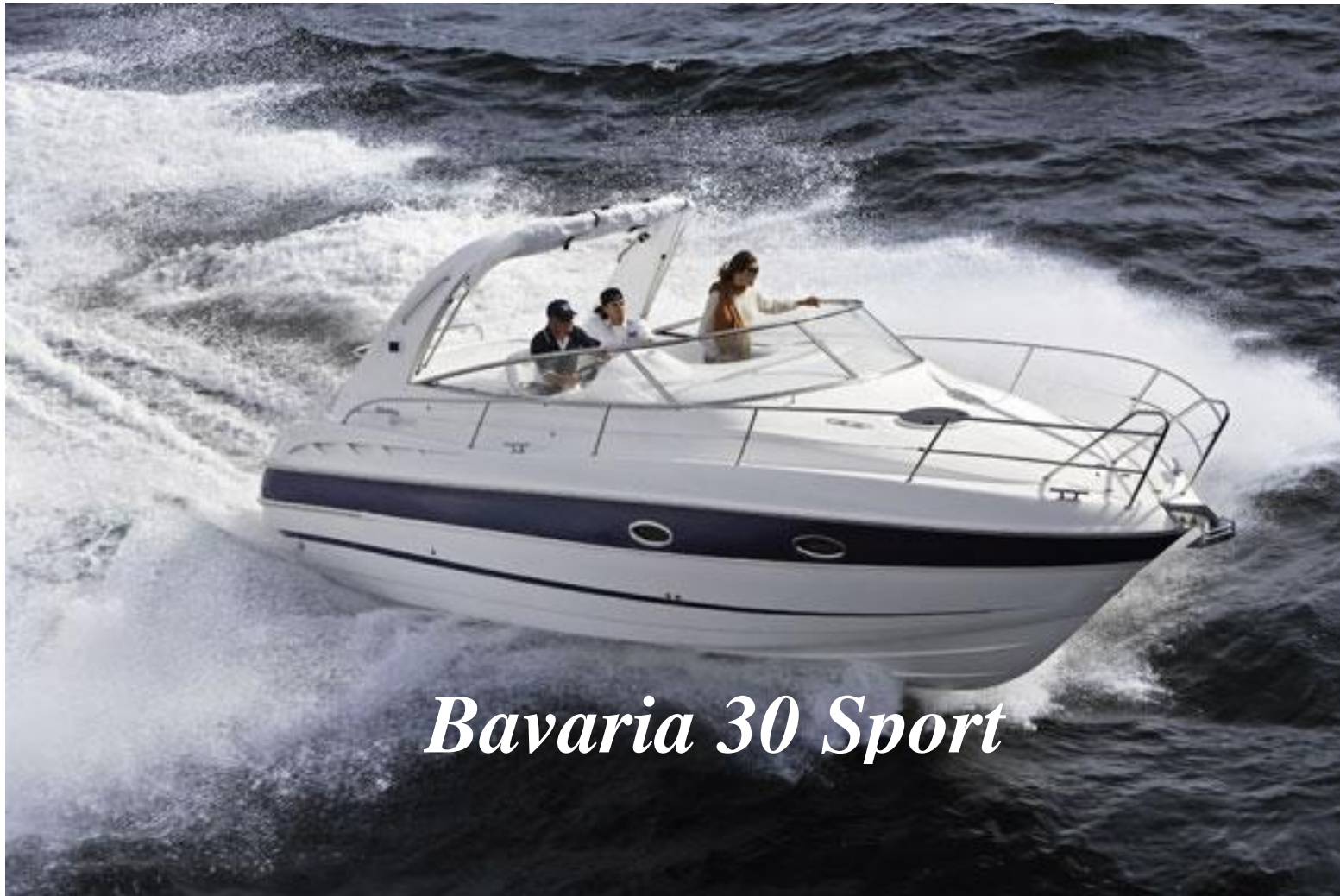
Bavaria 30 Sport